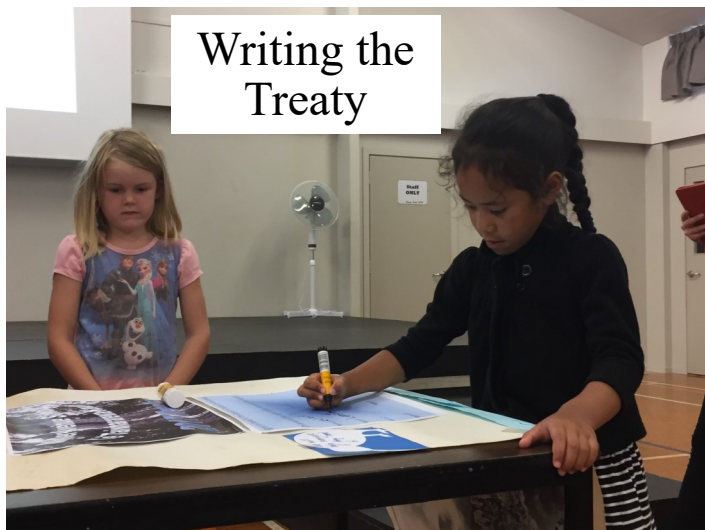
Writing the Treaty