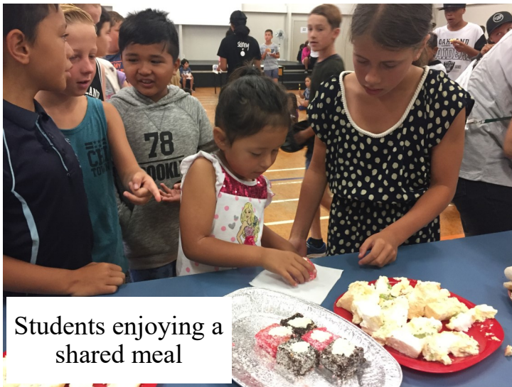
Students enjoying a shared meal

The treaty is hanging in the school office entrance.