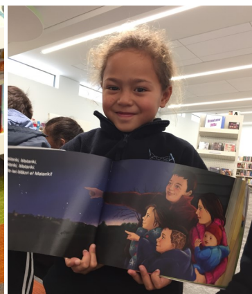
Reading about Matariki