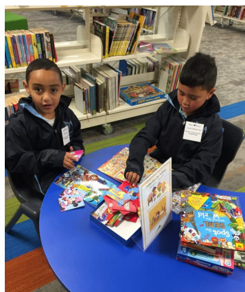
Reading with friends