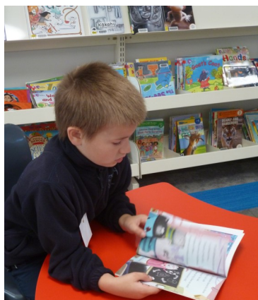
Great books at the library