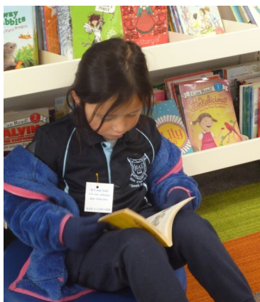
Enjoying a quiet read