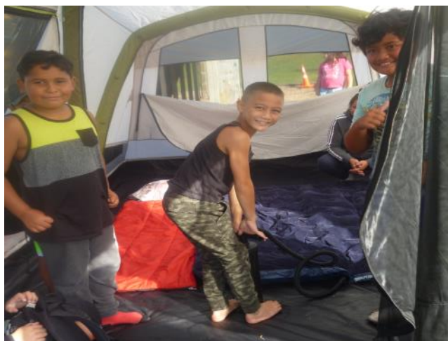
It's all about teamwork!