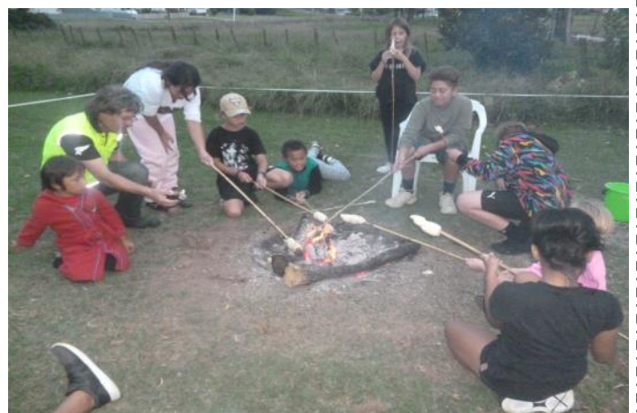
Cooking Damper was fun!