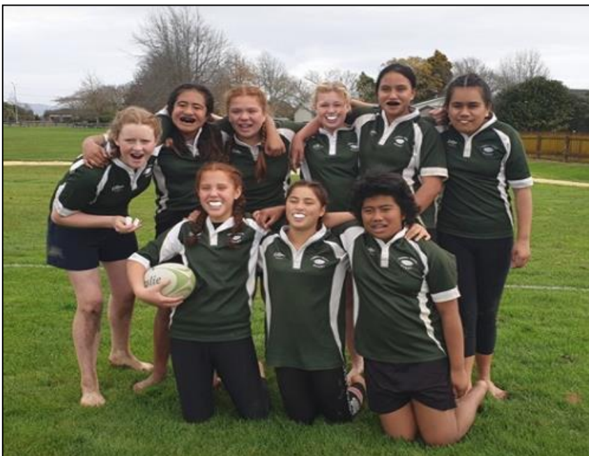
Our girls team who participated at the Tackle Rugby Tournament