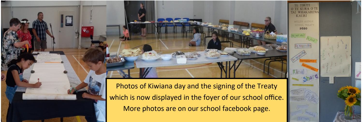
Photos of Kiwiana day and the signing of the Treaty which is now displayed in the foyer of our school office. More photos are on our school facebook page.

Bank Account: 03-1572-0010292-00 (please put in payment details) Westpac, Paeroa