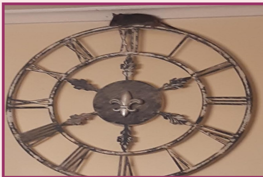
Clock - Hickory Dickory Dock the RAT ran up the clock!!!