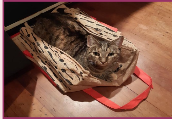
We know the 'Cat in the Hat' but... This cat loves shopping bags!