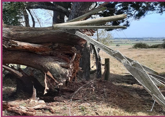
Tree - What happened here?

- J K Rowling , novelist, screenwriter and film producer